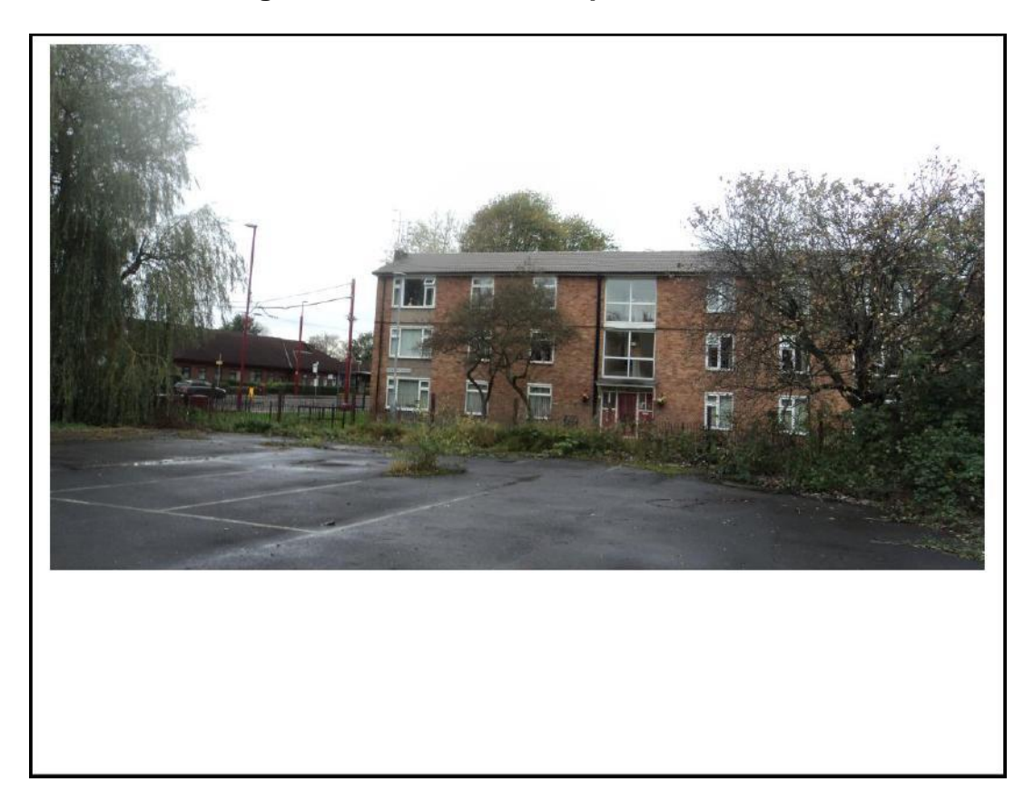
Photo 1 - Looking towards flatted development to the west of the site

Application Number: 10/01102/FUL Moss Tavern